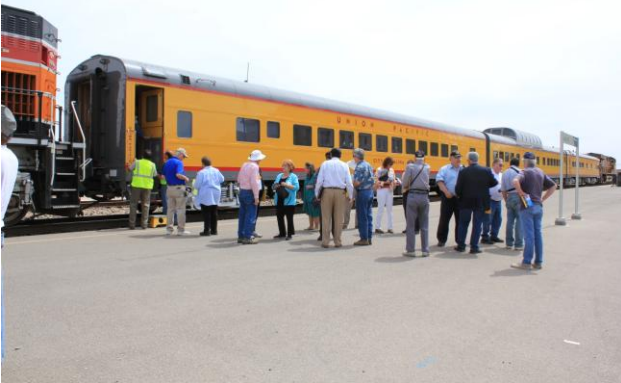
Three Passenger Cars between two Locomotives. We could only ride in the first two cars as the third car is the mechanics house.