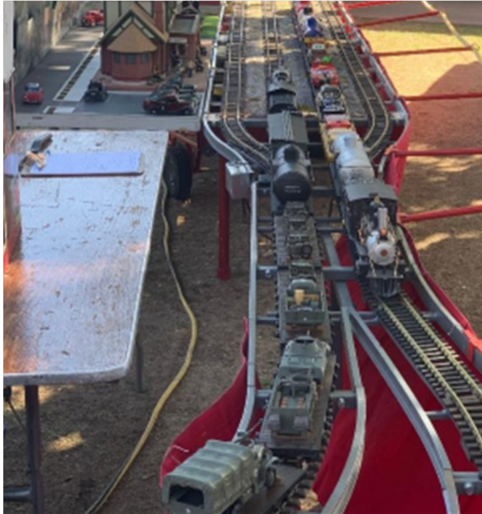
Railfair, McCormick-Stillman Railroad Park, 2024