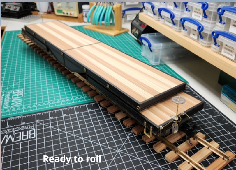
Ready to roll