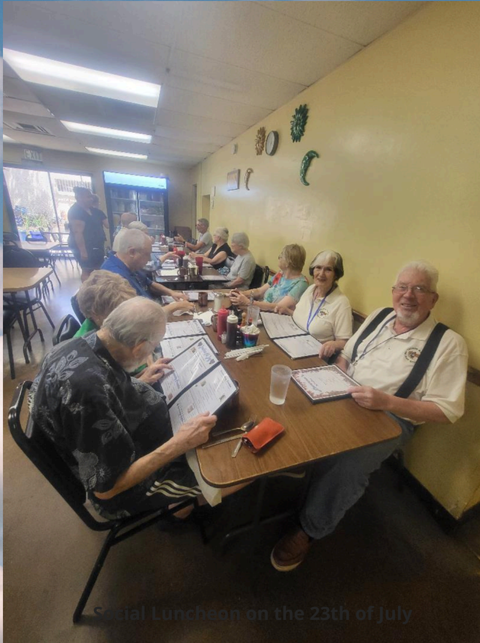
Social Luncheon on the 23th of July

French toast, shrimp, salads and burgers