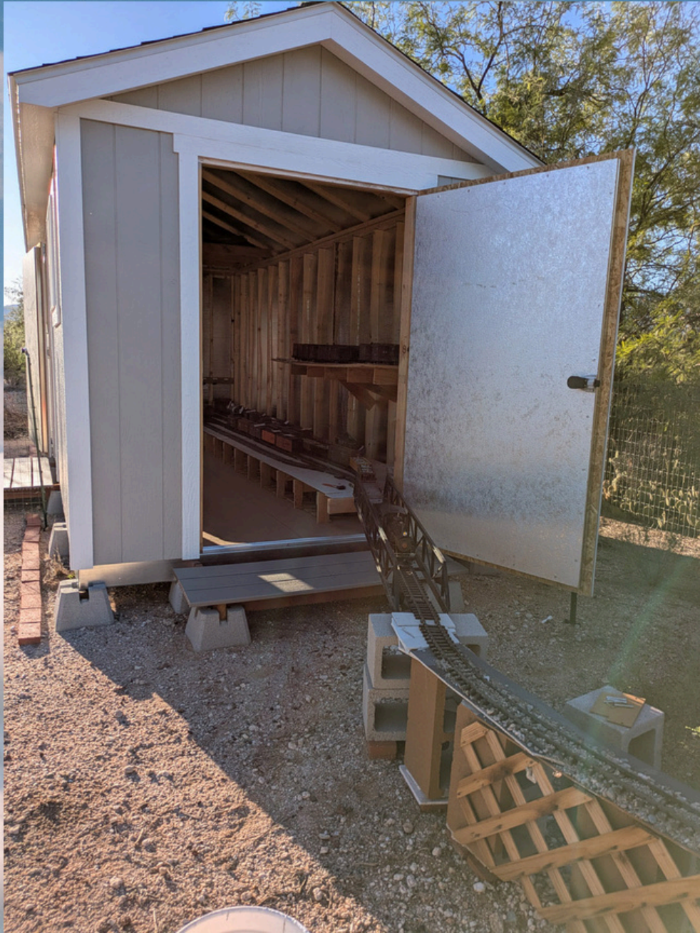
Charlies Staging Yard