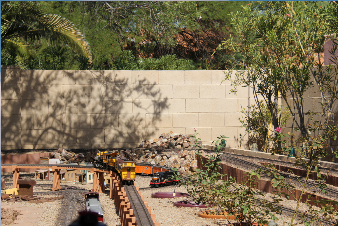
VERY OLD PHOTO OF FENNEMA'S LAYOUT