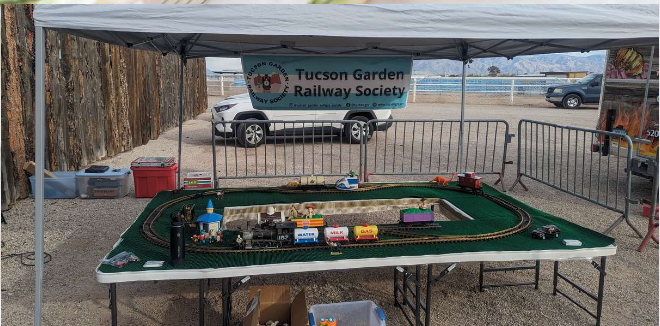
Our children's layout at the museum