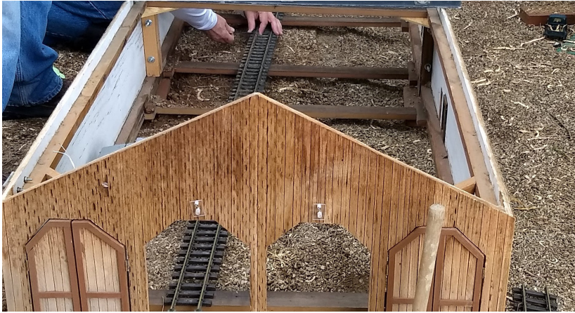
New Shed at the Tucson Botanical Gardens