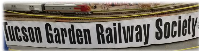
Our club sign displayed prominently

Thanks to everyone who were able to volunteer and showed up on time (if not early) for each shift.