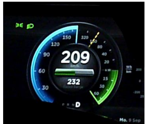
A Tesla Model S P85+ using regenerative braking power in excess of 60 kW. During regenerative braking the power indicator is green

Ore trains in Sweden traveling down to the coast generate five times the amount of electricity they use, powering nearby towns and the return trip for other trains.