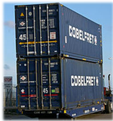
1By David Wright - Flickr: Moving Containers at Humber Sea Terminal

HI-CUBE (or HIGH-CUBE) CAR: Originally a box car of approximately 85 ft. in length and 10,000 cu. ft. capacity, designed for hauling automobile body stampings and other low density freight. The term has become frequently used to describe any box car of excess weight. (More about High-Cube Containers on Wikipedia .)