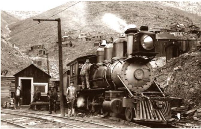
Workers pose with a United Verde & Pacific Railway engine in Jerome around 1900.