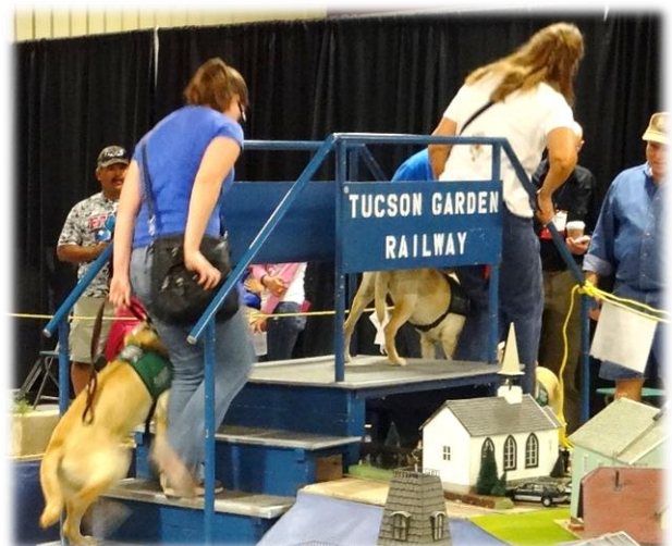
Our bridge being used to train service dogs

Fair attendees seemed to enjoy the layout and many questions were asked and answered. As usual, the children liked running Thomas and the other trains on the little layout.