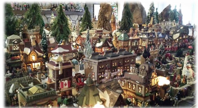
The Dickensian village layout took up an entire room!