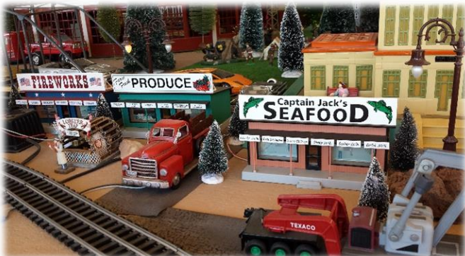
Notice the detail in their layout.