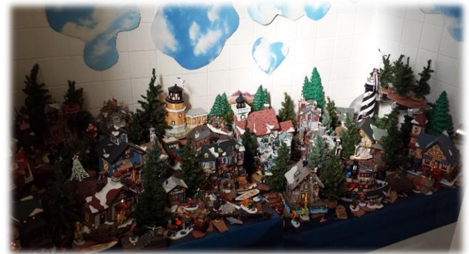
One bathtub was converted to a winter scene with the white wall tile complementing the 'clouds'.