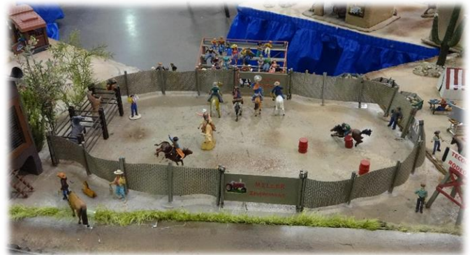
Rodeo with bronc riding

We had a good showing at the home show, especially considering the number of visitors to the show. We handed out lots of Rails in the Gardens cards and noticed quite a bit of interest from the attendees, hopefully we'll see a lot of them at RITG.