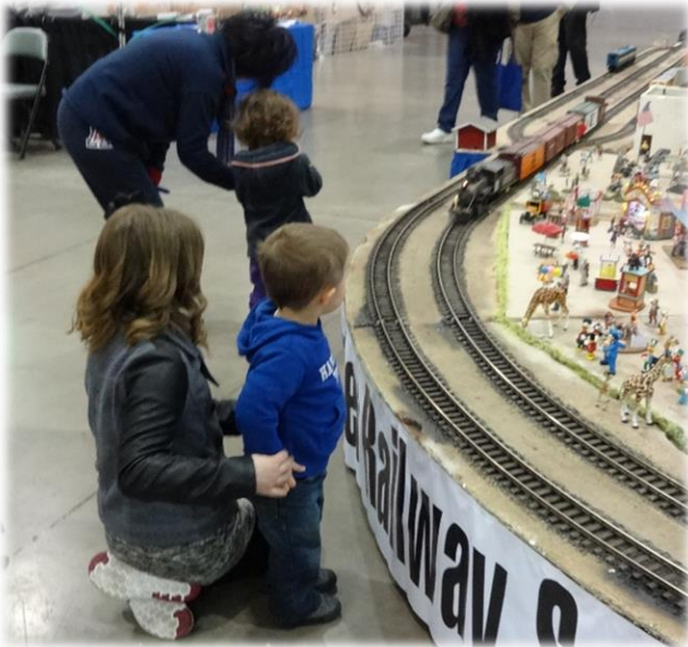
Some children are mesmerized by the trains. We even saw a tantrum when we had to tear down the display. I think we'll be seeing them at RITG!

We're really looking forward to our volunteering at the museum for RITG and hope you'll all send your RITG visitors our way.