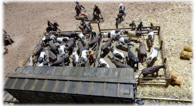
Loading cattle into the old box car was especially interesting and realistic.

We're really looking forward to our volunteering at the museum for RITG and hope you'll all send your RITG visitors our way.