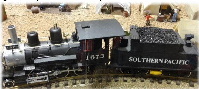
While there we got to see the train touring the layout and being enjoyed by the other visitors.