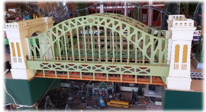
A beautiful bridge separated the upper level from the lower ones.