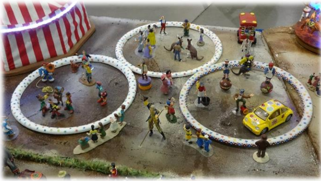
Three ring circus next to the midway