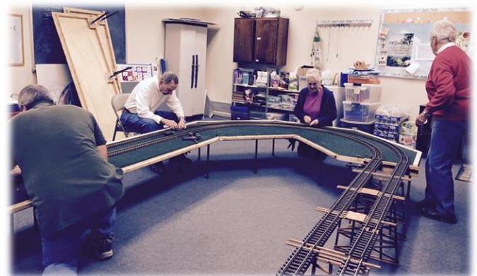
TGRS members setting up the layout

On December 1 st & 2 nd , the TGRS layout was running at St. Mark's for the enjoyment of all who stopped by.