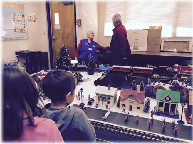
Layout being enjoyed by youngsters