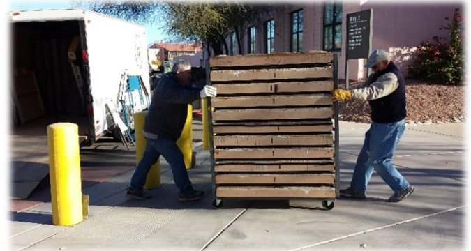
Unloading the trailer

On Saturday, December 26 th , a group of TGRS volunteers showed up at the VA auditorium to set up the train layout. The weather was brisk, to say the least, and the doors didn't open until 8:30am sharp. We got the trailers unloaded as quickly as we could and began the setup. By noon, most of the 'heavy lifting' had been done.