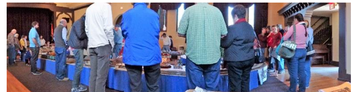
Layout being enjoyed by some of our older visitors