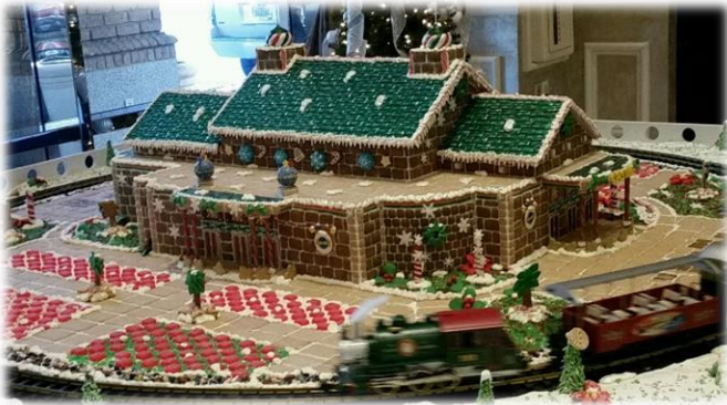
Gingerbread Casino Train Layout in lobby of Harrah's New Orleans (submitted by Jerry Tulino)