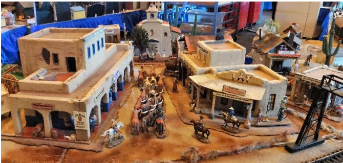
Adobe town with cattle stampede

Another observation was how many adults came in to see the trains without children in tow and seemed almost as excited as the children. It was really nice talking to the visitors and letting them know about the upcoming events in which the club is involved. We handed out many RITG cards and hope to see lots of new faces this spring.