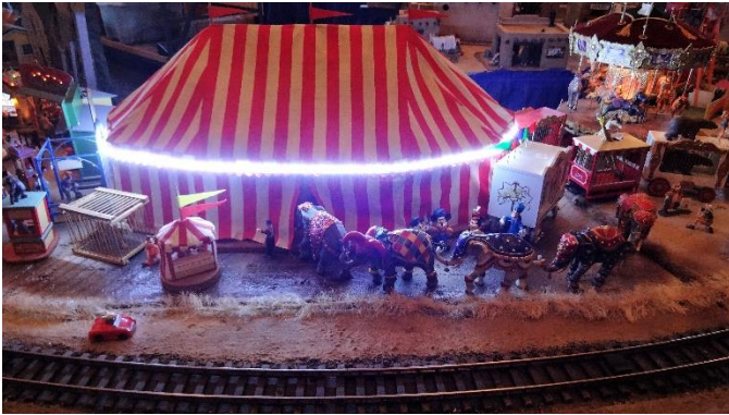
Elephants entering the big top

Another observation was how many adults came in to see the trains without children in tow and seemed almost as excited as the children. It was really nice talking to the visitors and letting them know about the upcoming events in which the club is involved. We handed out many RITG cards and hope to see lots of new faces this spring.