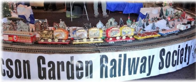
Circus train rolling down the track