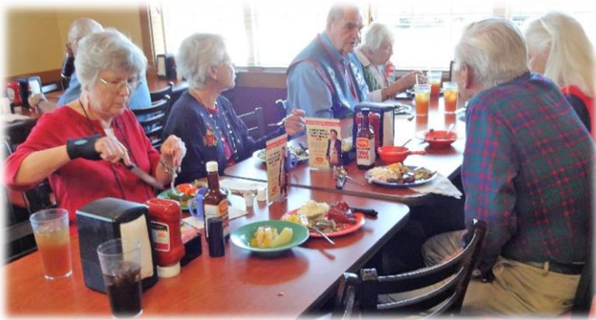
Folks enjoying the buffet lunch and good company

We all had the usual feast of “small” portions of the food we would never eat at home, but it was a buffet, so what the heck!