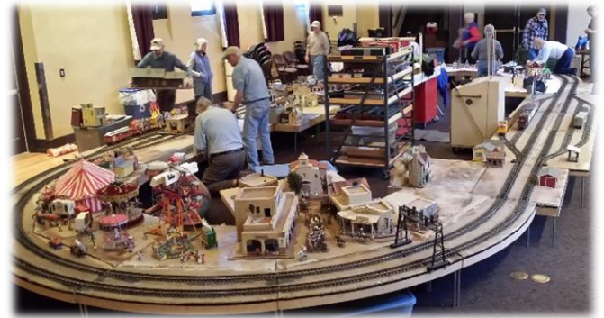
Progress on the layout

On Saturday, December 26 th , a group of TGRS volunteers showed up at the VA auditorium to set up the train layout. The weather was brisk, to say the least, and the doors didn't open until 8:30am sharp. We got the trailers unloaded as quickly as we could and began the setup. By noon, most of the 'heavy lifting' had been done.