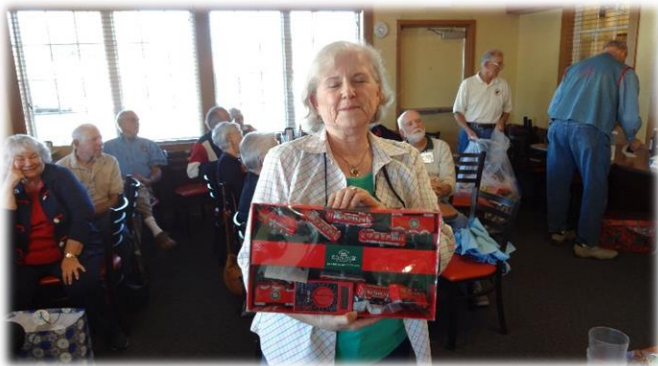
The 'stolen' loot...