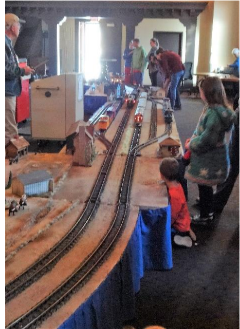
Waiting for the train to come 'round the bend