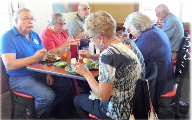
Some serious eating going on here

Then came the short meeting with the usual need for volunteers for our busy end of December to middle of January.