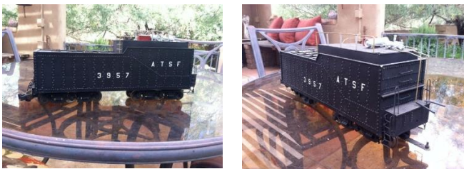
Big tender build by Dick Izen