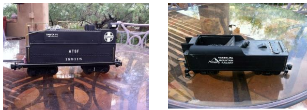
Modified 10 wheeler tender