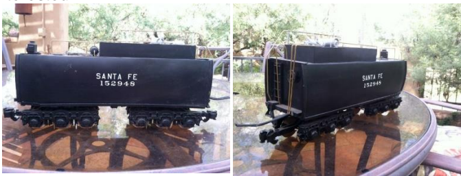
Tender we will build

Call me on my cell at 343-2881 with any questions and location address. We can work on multiple projects if interested.