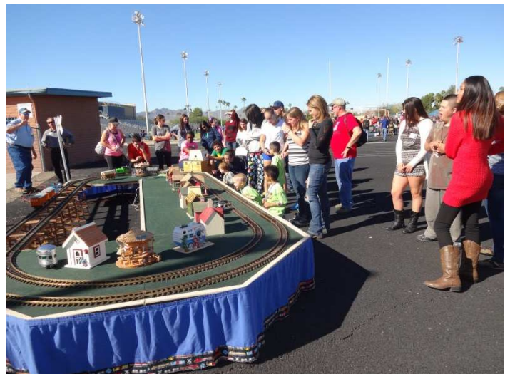
Our Fearless Vice-leader at the Martin's