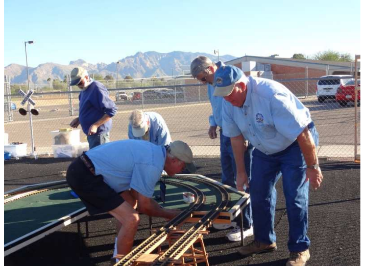
Setup at Richie's Walk Participants at Richie's Walk