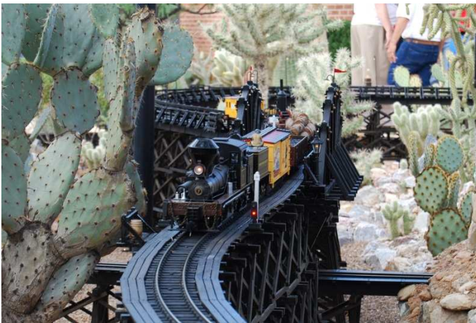
Climbing the grade at the Carmichael-Pappas RR