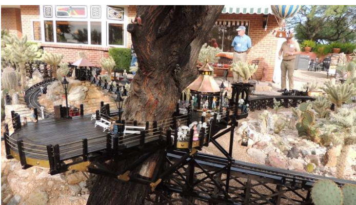
The gazebo on the Cactus Patch Railroad