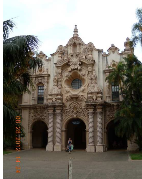
The entrance to Railroad Nerdvana, San Diego