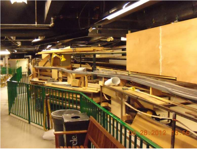
A work in progress ( La Mesa Club Layout

The Tucson Garden Railway Society is a non-profit corporation incorporated in Pima County, Arizona. Society members are interested in all areas of garden and modular large scale railroading. We welcome new members and hope you will consider joining. Members help each other build layouts and learn about railroading and modeling. The TGRS dues are $30.00 per year and are due on June 30th of each year. For new members dues are pro-rated at $2.50 per month remaining in the year until June 30th, the first year. Additional name badges cost $1.00 for each badge after the first.