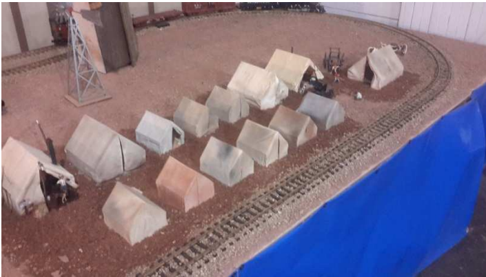
The tent city installed, the ground is still wet when it dries it will be the same color as the rest of the layout