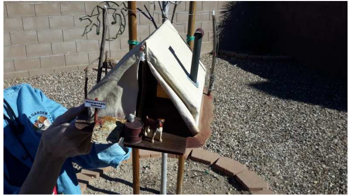
More Happy tentmakers making small tents for the TRM.

Tents with open ends can be detailed inside like the one in the following picture