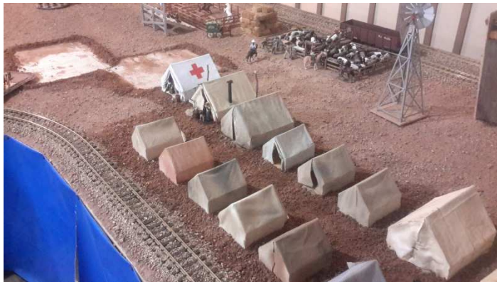
The tent city from the East, the two blank areas are for the liquor store and saloon.