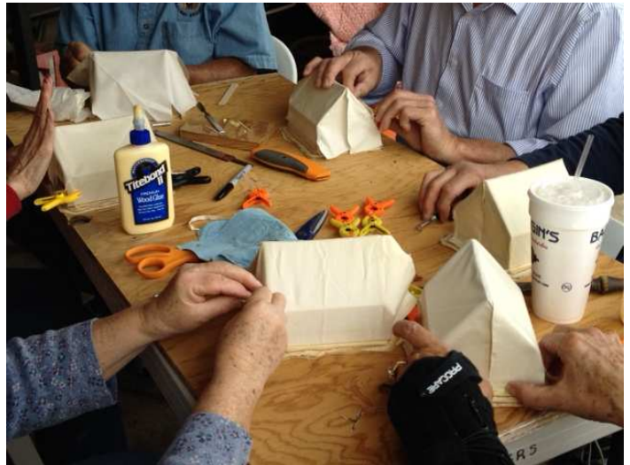
And the frame for a large tent assembled and ready for canvas.