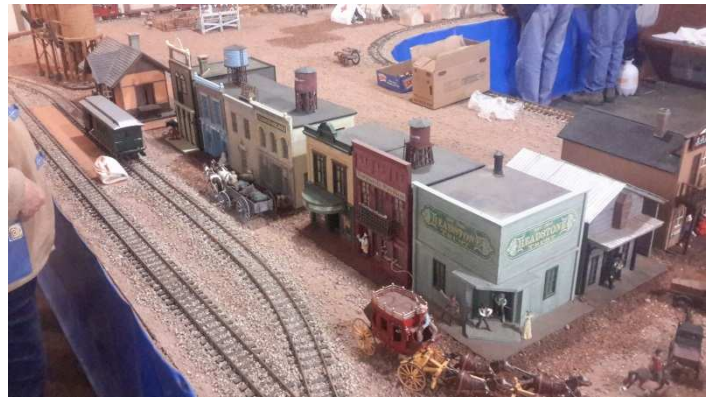
Main street from the southwest.