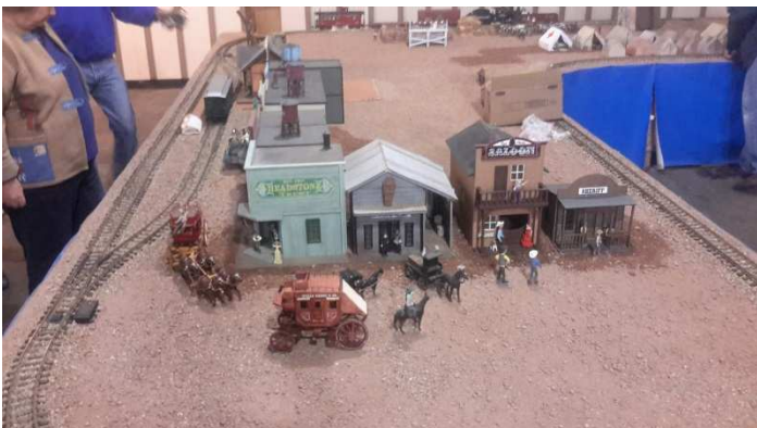
The south end of town