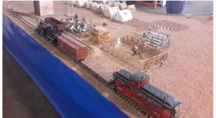
And the train and Rodeo grounds