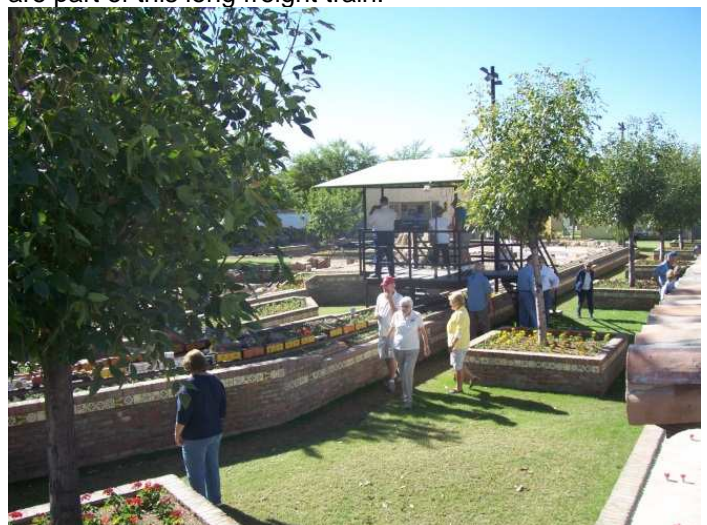
The railroad is so large and complex that steel viewing platforms were erected to help the visitor grasp its' scope.