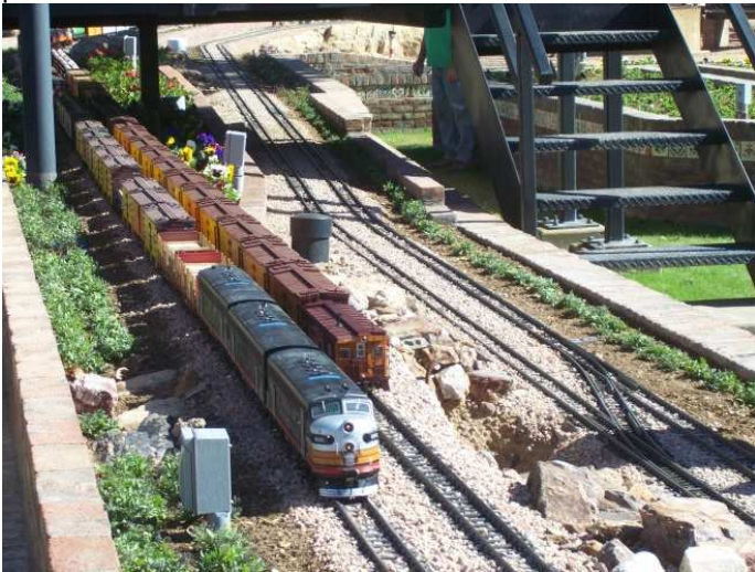
An A-B-A set of Southern Pacific F units pulls another long freight train towards the front of the layout while steam freight from prior picture passes going uphill towards the rear.