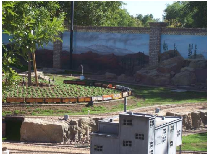
Note the mix of molded concrete and painted mountains and the extensive plantings as the Daylight pull its' freight around a curve.