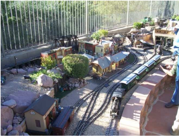
A passenger train passing across from the main station and town.

The layout featured lots of bridges and embankments held by stone and cribbing and had quite a bit of track in a fairly small space.