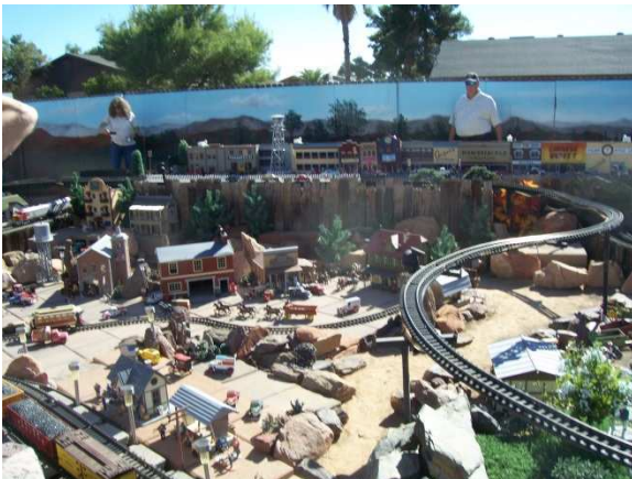
This view shows the streetcar and town while freight on one of the lower loops passes through the left corner of the photo.