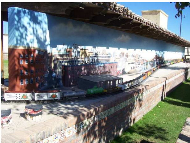
Powered by a Union Pacific Big Boy, 72 car freight rounds the newly painted backdrop industries.