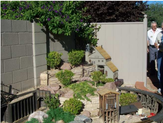
Mine tucked into "L".

The layout featured lots of bridges and embankments held by stone and cribbing and had quite a bit of track in a fairly small space.