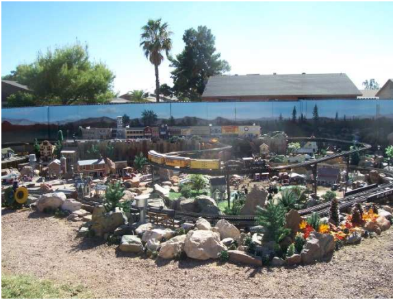
A passenger train rounds the curve on the upper level. The painted backdrop expands the 'real estate' in the relatively small yard.

That layout is a hard act to follow but our next stop was at Jim and Joanne Gardner's pike. They have quite a bit of track on multiple levels in a fairly small area filled with buildings, people and scenery. The basic layout has two complete loops and a back and forth streetcar line at ground level and another loop on the elevated level. This allowed three trains plus the streetcar to run at the same time.