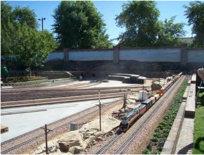
Southern Pacific engine in 'Daylight' passenger colors hauls long freight near front of layout. Note the extensive yard and roundhouse facilities. Dennis likes long trains and runs trains that are difficult to encompass in a still photo.