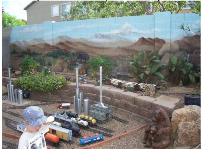
A passenger train on the upper loop passes behind the refinery.