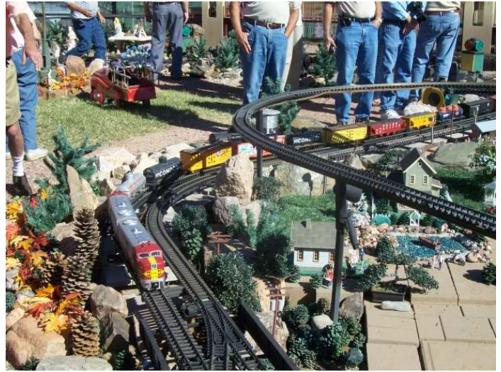
Diesel powered freight on one of the lower level loops.

Next was Wesley and Alison Schriver's pike. Two loops of track run around the edge of the backyard and provide access to a side yard storage area which has a third loop. A raised bed supports a separate loop in front of a painted backdrop.