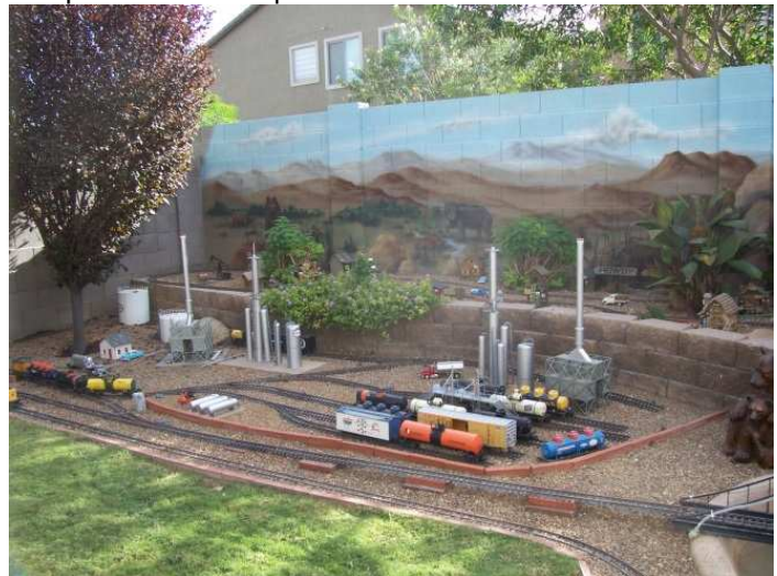
The layout includes this impressive refinery.

Next was Wesley and Alison Schriver's pike. Two loops of track run around the edge of the backyard and provide access to a side yard storage area which has a third loop. A raised bed supports a separate loop in front of a painted backdrop.