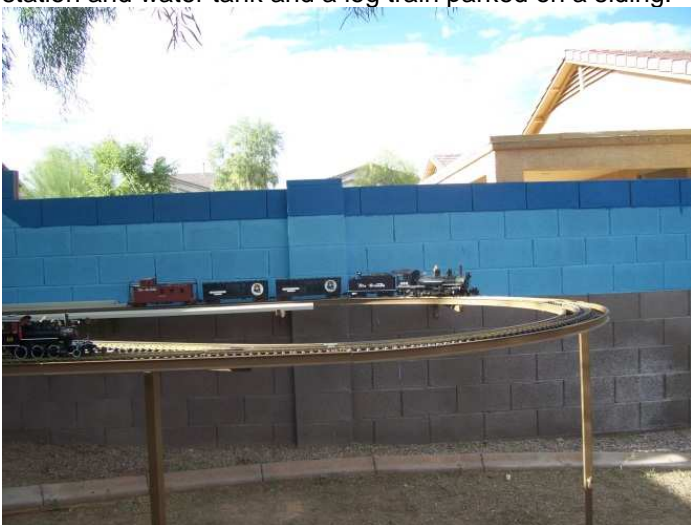
The same train hauling two empty 2008 convention stock cars runs down the side wall.

The six layouts varied tremendously in size and complexity as well as what stage of construction they had reached. All of them offered ideas for how things might be done.