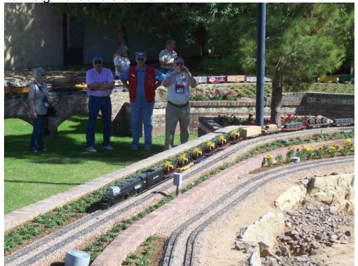
Here is the Big Boy at the head of its' 72 car train. The cars in the background behind the TGRS club members are part of this long freight train.