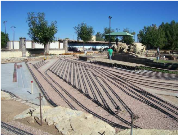
This overall view of the yards with the viewing platform and the painted backdrop area gives some idea of the vast scope of the layout.

That layout is a hard act to follow but our next stop was at Jim and Joanne Gardner's pike. They have quite a bit of track on multiple levels in a fairly small area filled with buildings, people and scenery. The basic layout has two complete loops and a back and forth streetcar line at ground level and another loop on the elevated level. This allowed three trains plus the streetcar to run at the same time.