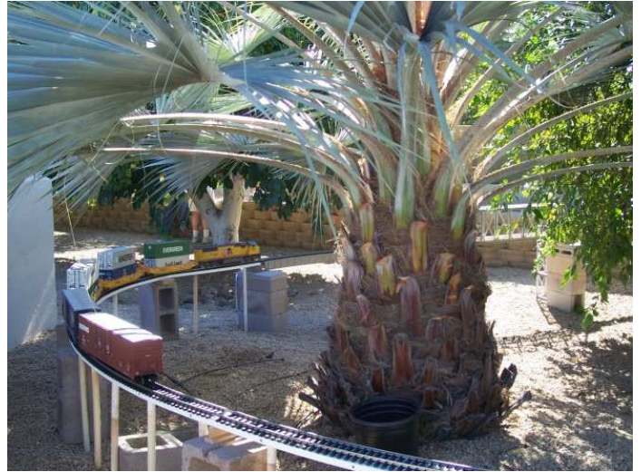
A modern freight on the helix used to gain elevation.

All trains are planned to be 1990 or later so there will be no steam on this layout. The diesels are sound equipped and battery powered using power tool batteries. When we visited there were about 640 feet of stainless steel main line and another 150 feet of borrowed brass track to complete the main line.