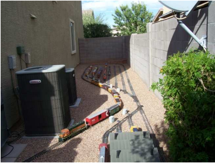
Here is a view of the side yard storage area and its' loop.

The sixth and final layout belonged to Steve and Judy Lewis. It was an "L" shaped loop elevated on a metal structure.