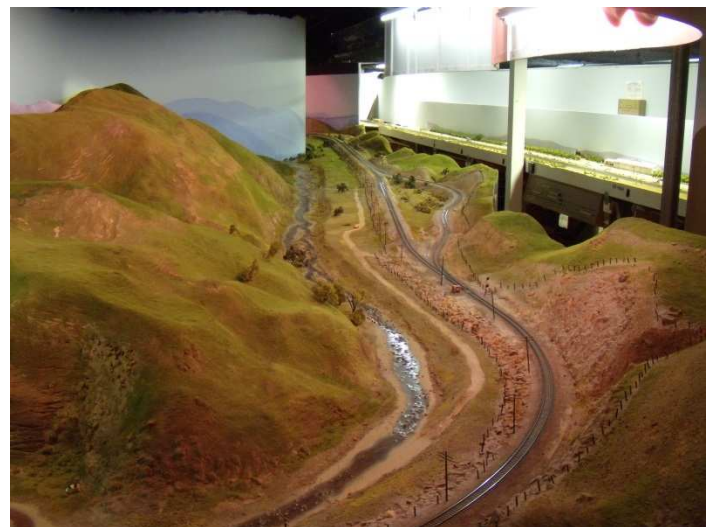
That's the scenery at the siding at Ilmon