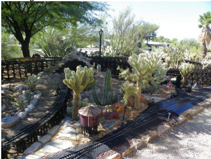
Looking towards the entrance