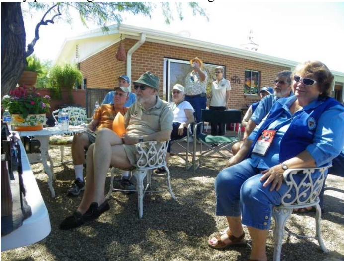
And his fascinated audience.