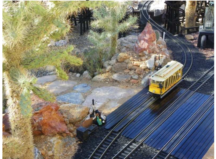
The Trolley station