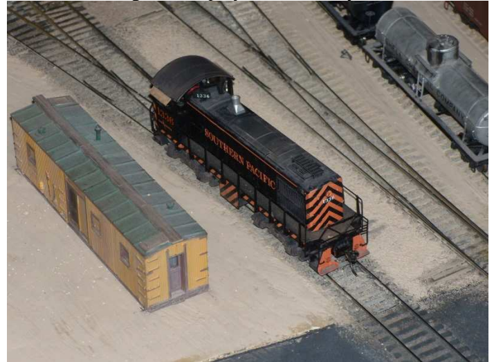
And a picture of the SP yard in the middle of the shift with two reefer block trains have ready to leave with a total of 130 reefers heading for Mohave

My job was to classify cars for the various trains and cut in helpers for trains. Sometimes as many as three helpers for a long (110 car) train. Then a lead engineer and helper engineers take the trains up the hill. Here is a picture of my switcher waiting while I play cards in the yard shack.