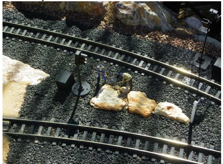
Railroad workers on the ROW