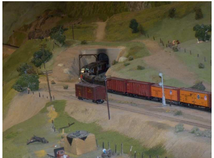
Here is the train entering the tunnel east of Bealville