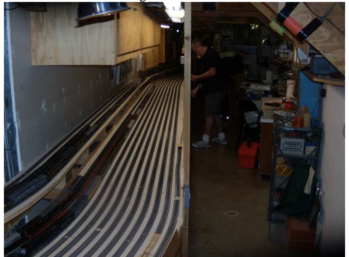
And this is one of about six storage yards tucked away all over the layout and the chief dispatchers and clerks office