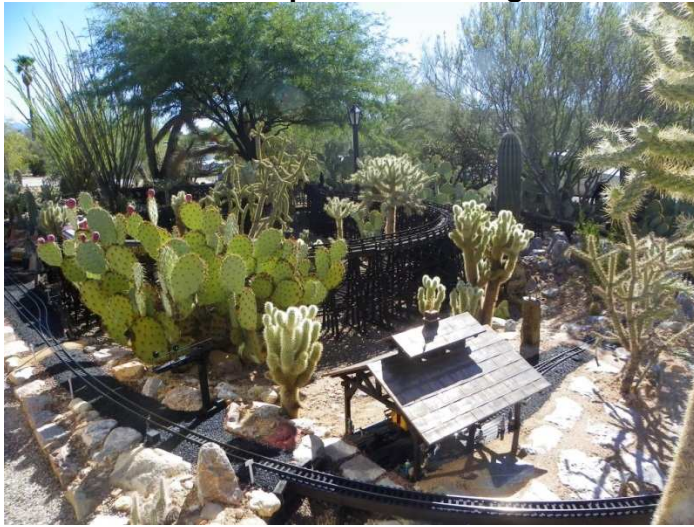
Entering the Railroad