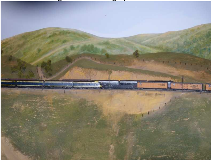
Two freights passing near Bealville