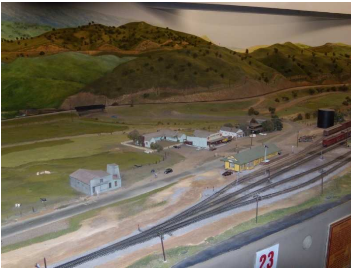
Here is a view of Caliente and the start of the hill to Allard and Bealville then the loop.