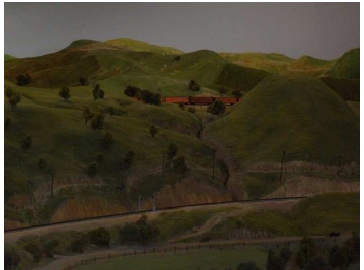
The tail end of one of the freights on the hill above Caliente