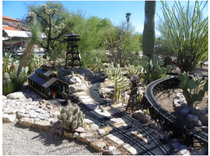
The Fire Tower and Engine House