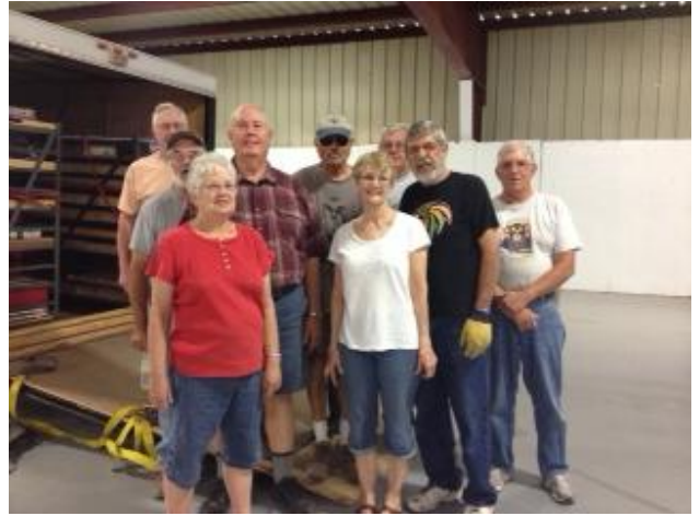
Load Out Crew