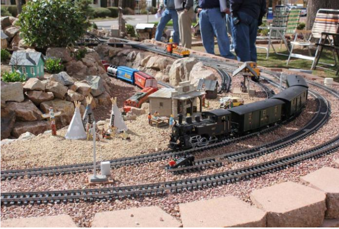
Photos from the February 9 th Meeting at Rincon Country West RV Resort