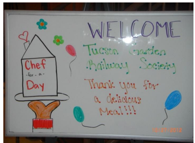
The whiteboard welcoming TGRS