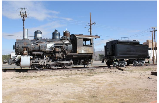
0-6-0 Switcher with lots of rust in front of the Clovis Depot