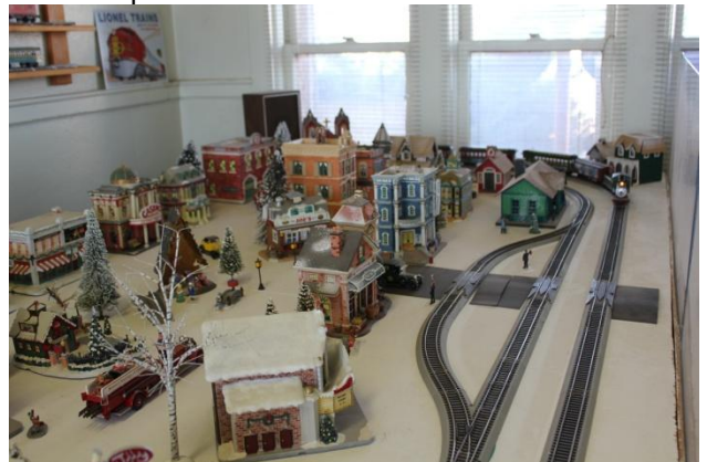
One of the many layouts on display, Clovis Depot