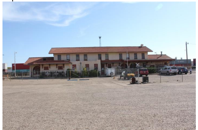
Clovis Depot Model Train Museum