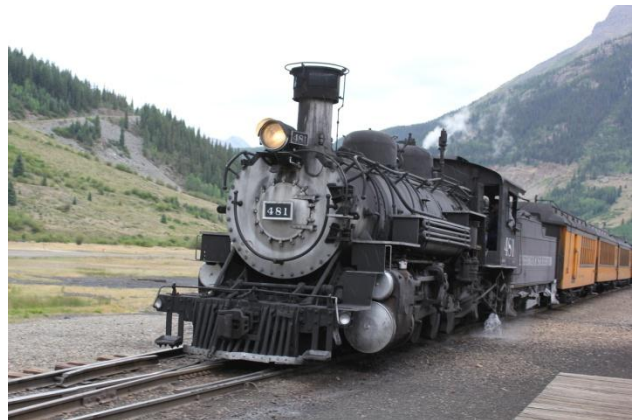
I shot this picture in June with a Canon digital SLR camera