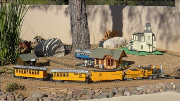
The Catalina and Rincon Saddle (CRS) RR