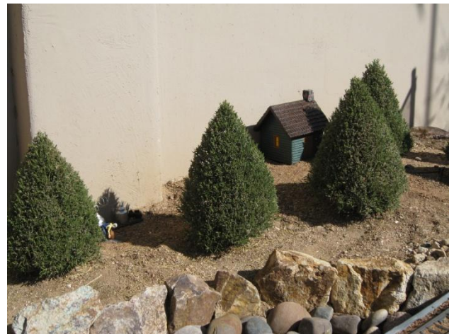
The Catalina and Rincon Saddle (CRS) RR