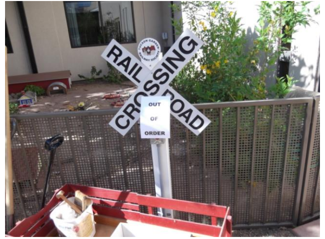
The layout was closed for repairs