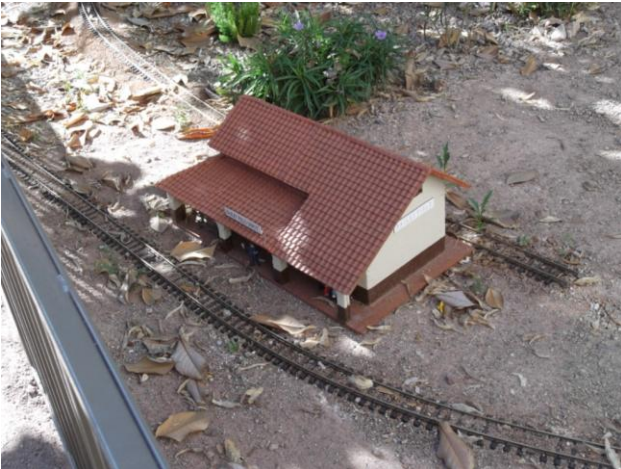
More TMC Layout Damage