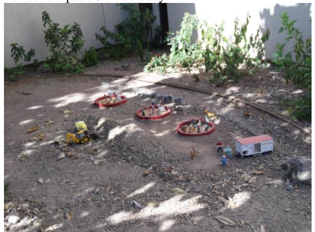
TMC Layout Damage

I took these photos this morning after placing the items on the layout. We suffered some extensive damage from vandalism last week - broken animal wagons, couplers and the 10 wheeler's smoke stack was taken. I had a spare stack, and was able to repair the animal wagons, but the couplers won't be here till next week. I've had a long talk with the TMC Foundation President about the theft and vandalism problem, and he will have Security place a camera in the patio, and Maintenance promised to monitor the patio 3 times a day.