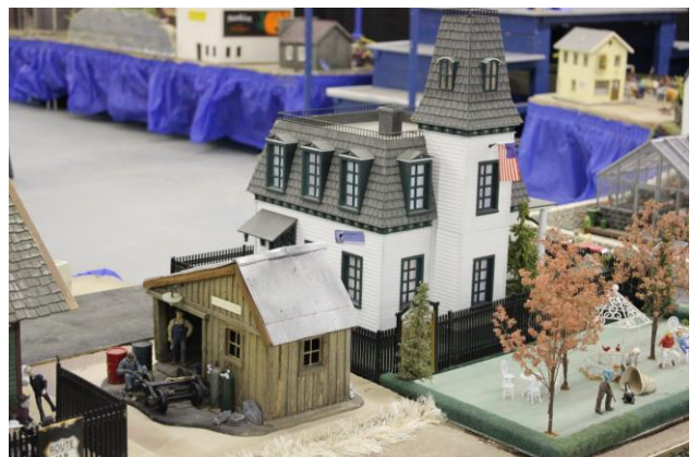
Madelyn asked if it is safe to have a welding shop behind her Mansion