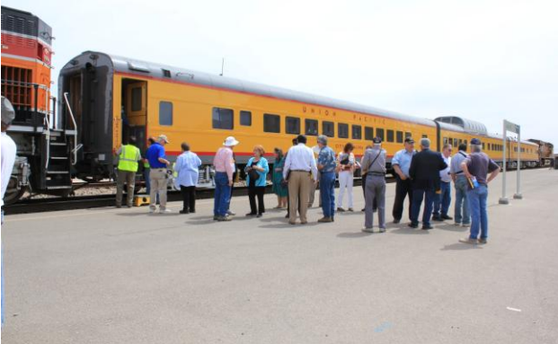
Three Passenger Cars between two Locomotives. We could only ride in the first two cars as the third car is the mechanics house.