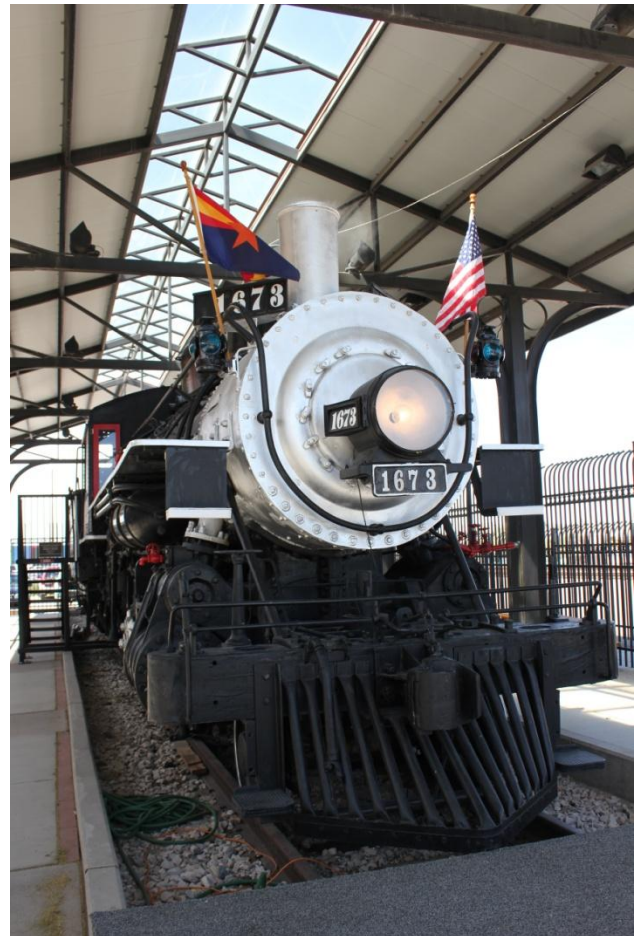
Everyone enjoyed the tour of Locomotive 1673

The Southern Arizona Transportation Museum has their own Garden Railway.