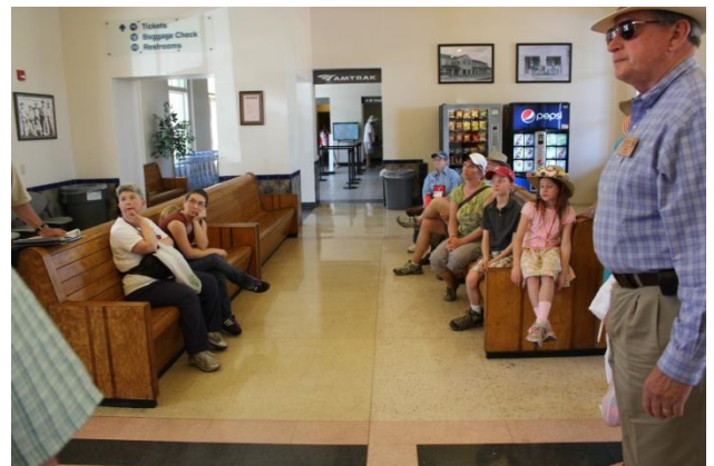
Members enjoying the tour of the Depot