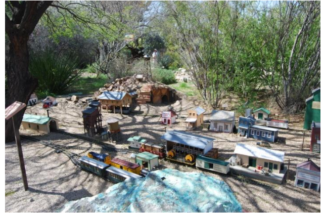
Tucson Botanical Gardens Railroad