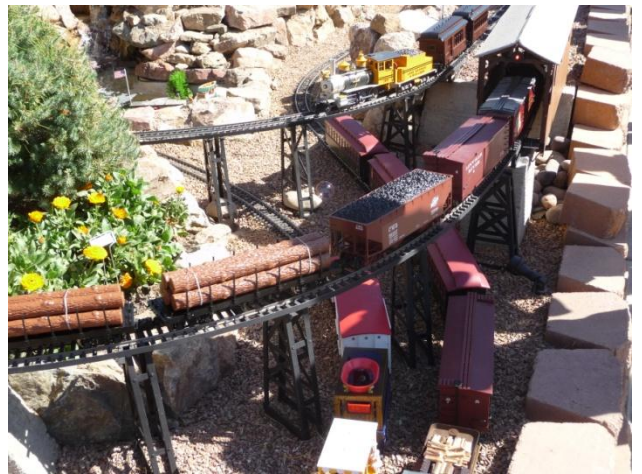
Intersection of 4 loops