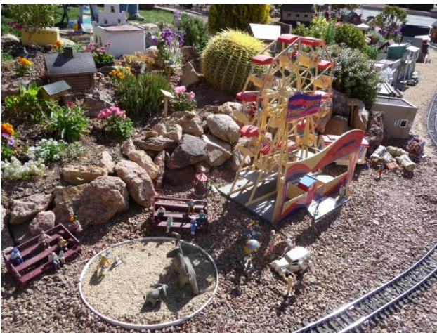
Circus surrounded by vegetation