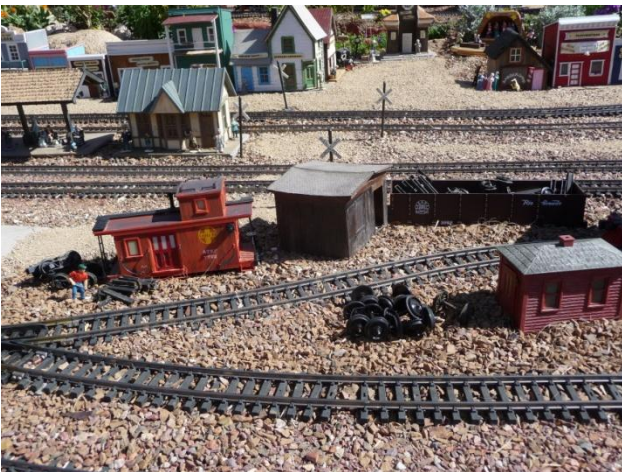
RR yard and village of Rincon