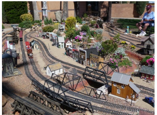
Overview of lower area of layout with village of Rincon