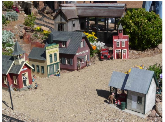
Saw mill in background