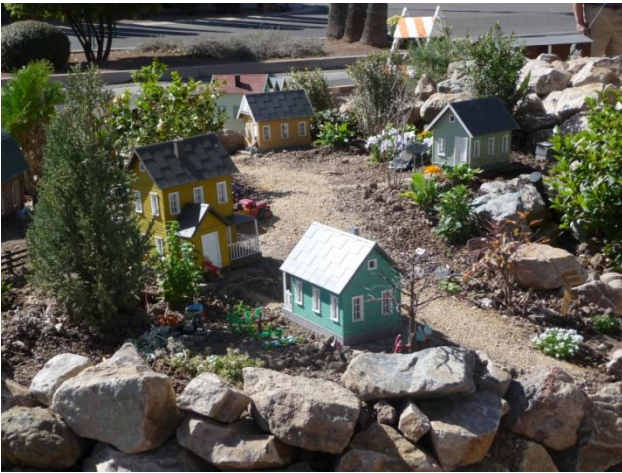
New 40's era rural village