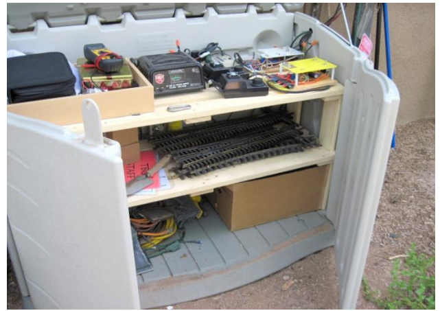
Enclosure for Power Supplies and Train Control Systems

The Tucson Botanical Gardens' layout has developed into a very nice, attractive garden railroad. This spring the layout was expanded to add a second, outer loop of track that permits two trains to operate which adds to the visual interest of the railroad. The expansion was primarily carried out by TBG members/volunteers with a little help from TGRS members. Thorne Pierce scratch-built the through-truss bridge for the "stream" crossing on the new loop (see photo). Also, TGRS donated an enclosure for the power supplies and train control system. This enclosure will better protect the electronics from weather as well as provide a little storage place for items needed near the layout. If you haven't seen the TBG railroad in a while, you should make it a point to see it soon.