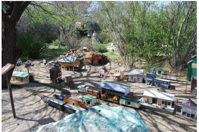
Tucson Botanical Gardens Railroad

The Tucson Botanical Gardens is on the East side of Alvernon Way a little South of Grant Road