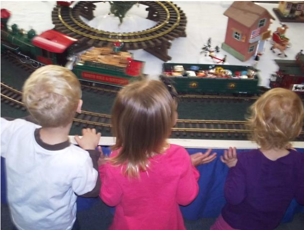
The Children enjoying the layout at St. Mark's