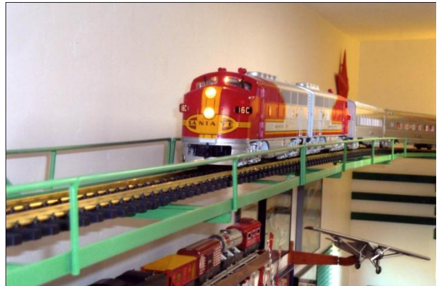
All aboard! At 8' high