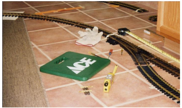
Trying to figure out the switch track's angle on the dangle

Can't say that I'm a full-fledged garden railroad enthusiast—cars are my passion. But I enjoy toy trains and have found the Tucson Garden Railroad Society folks to be very friendly and helpful. I intend to have an open house for club members sometime in the near future. Hope to see you then!