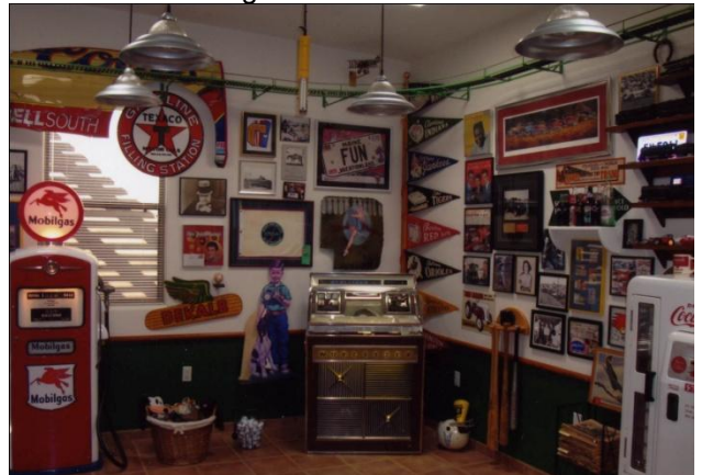
Home of the Tucson Norte Railroad