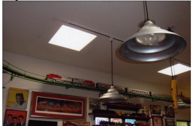
F-3 War Bonnet in action