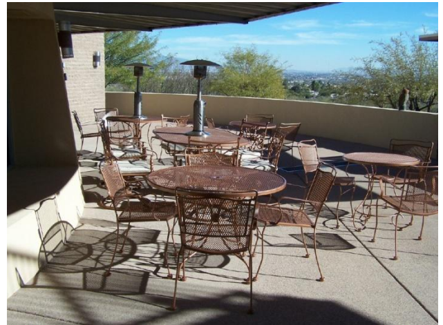
South Patio Dining

Jim is a TGRS Buff but does not have a railway (except for a switcher shuttling model autonomous trucks back and forth in his Great Room. Driving directions, go west on Starr Pass Blvd. about three miles from I-10