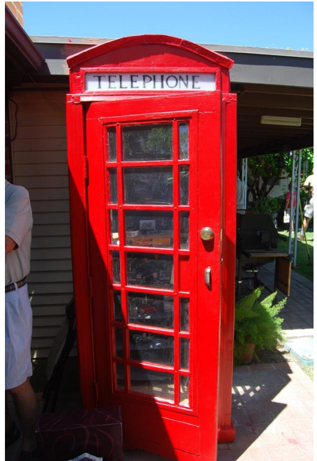
Telephone Booth by the Garden Railway