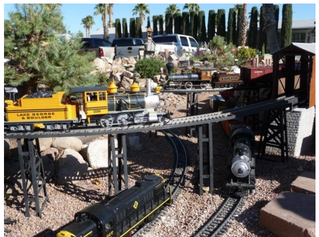
The RCW Railroad

From I-19 take the Ajo Exit and proceed west on Ajo Way to Mission Rd. Turn left onto Mission Rd. and proceed approximately ½ mile to a left turnout (3rd turnout on Mission Rd.). Turn left here at white entrance wall marked 4545 and flag flying. Go 500 ft. and turn right into RCW Resort. Stop at gate keeper building and indicate you are attending TGRS meeting. Proceed straight down the boulevard to large parking lot on the left. There is parking all around the buildings in this area. The RCW Railroad layout is located at the end of the parking lot.