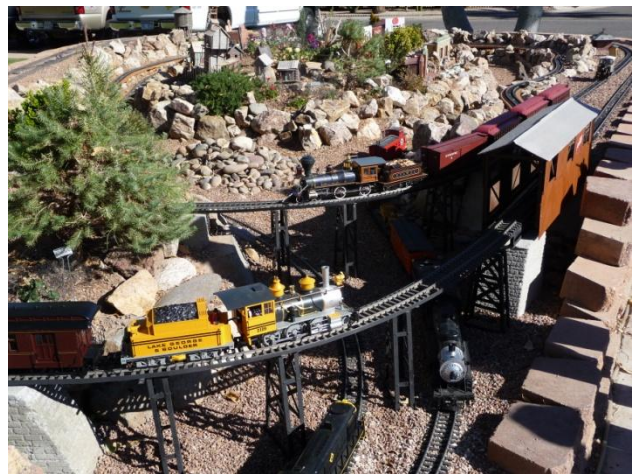
The RCW Railroad