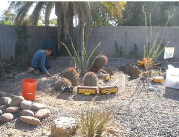
The Whelan family visits the Arizona Railway Museum in Tempe