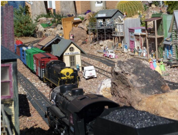
The RCW Railroad

This winter club members added over 100 ft. of track and a new loop while also doing extensive regrading of the upper area of the layout. New trestles and a covered bridge have also been added to the layout. Future plans include a water feature and new tunnel.