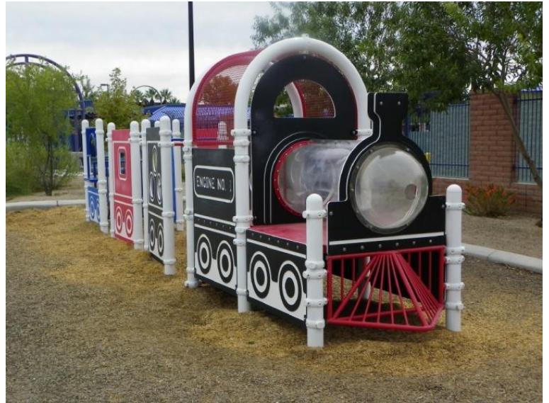
Train in Pantano River Park

Tucson groups that are beautiful and imaginative. Hope the members have a chance to visit sometime.