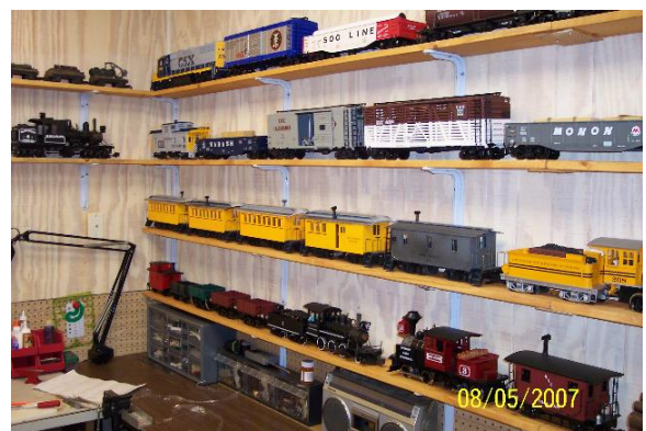
Engines and rolling stock for the CJRR