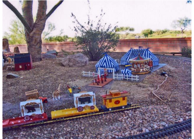
The Circus is coming to Cactus Corners RR

Going North on Oracle to Rancho Vistoso, turn left, going South from Saddlebrook, turn right. Proceed to Del Webb where you turn right. Proceed to Bighorn Mtn. where you turn right. It is the 4 th house on the right.