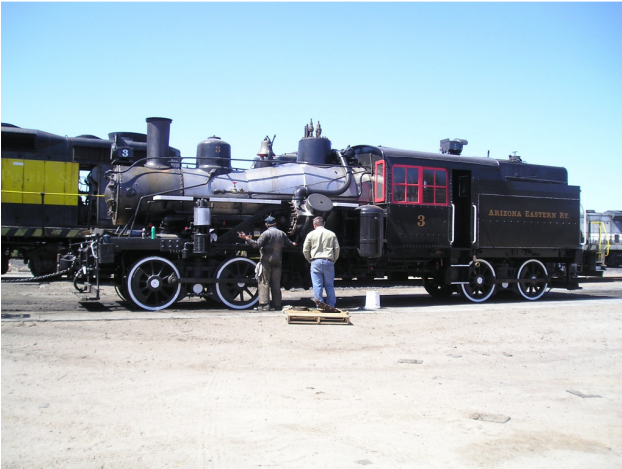
The broken Heisler Locomotive