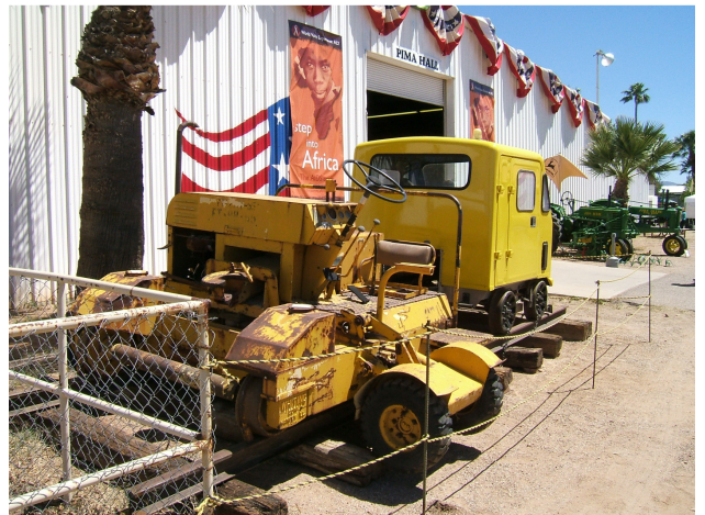
Power from the past has railroad equipment