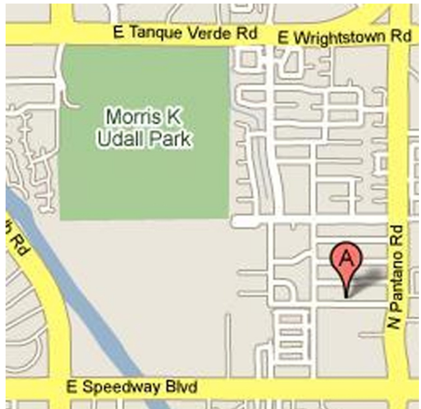
Map to Rick and Sue Gast's home

To get here from Rick's house, take Pantano Rd. South to 22 nd Street and turn right (west). At the second light, Prudence, turn left (south) and continue until you reach a stop sign. (29 th Street). Turn Right (west) on 29 th Street. We are the fourth grey house on the right (north) side. 7501 E 29 th Street.