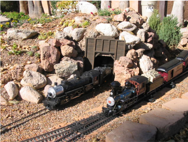
More Power on the Rincon Country West Railroad