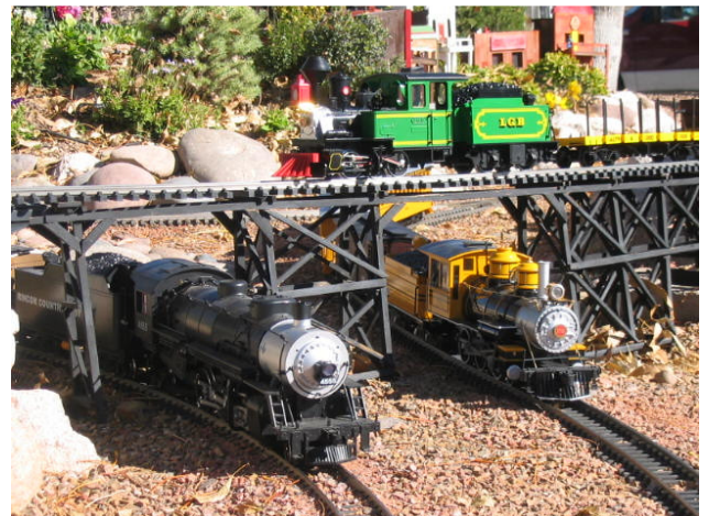
Three Locomotives from the Rincon Country West Railroad

Take I-19 S, go 1.3 mi to Ajo Way, exit 99. Turn Right (W) at Ajo Way, go 0.9 mi. Turn Left (S) at Mission Rd., go 0.6 mi. Turn Left at Via Ingresso-entrance to Rincon Country West. Take immediate first Right at Gate House entrance. Once through gate proceed down main boulevard to club layout