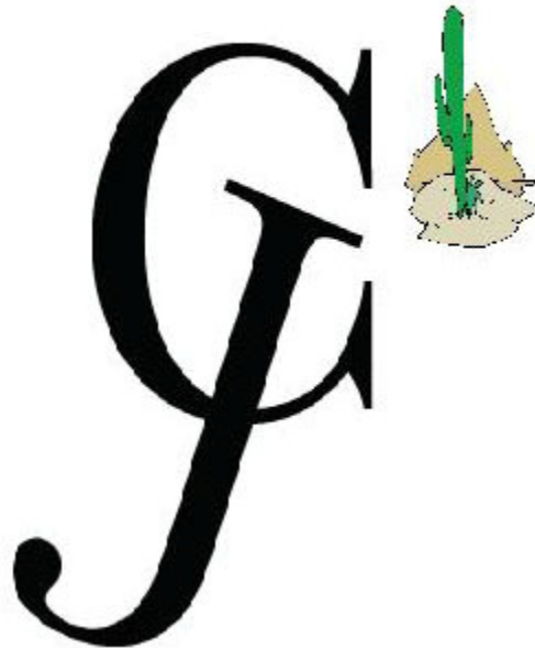
Logo of the CJRR

Critterland Junction Railroad "The Desert Route"