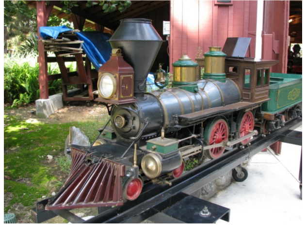
Copy of the Lillie Belle. The original is still in the possession of the Disney family.

He put his engineering staff to work designing a scale model of an engine he remembered from his childhood days and built a railroad on his property. The engine and all rolling stock were scratch built by Disney's own staff, with him learning and helping along the way. He named the engine "Lilly Belle" after his wife. There are a lot of stories surrounding his home railroad that makes for great reading.