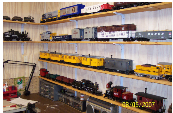
Engines and rolling stock for the CJRR