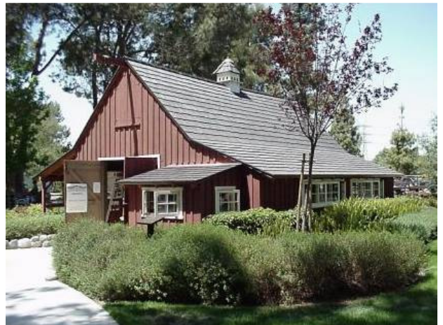
Walt's Barn at Griffith Park