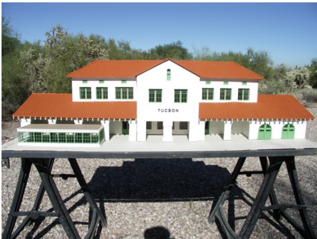
The finished Depot

The roof is a 0.040 inch styrene sheet base covered with more than 12 sheets of Plastruct # 91632"styrene jumbo (double size) G-scale Spanish tile"). For sun protection it was painted with Delta Ceramacoat "terra cotta" from Michaels Craft store. The lettering is plastic letters from an old stationery story sign board set.