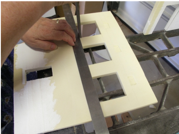
Trimming one of the sides

Working with original drawings and numerous trips to the prototype, Wayne developed his construction plan. The model was built to 1/32 proportion since the real structure is enormous. Over 100 scale feet of repeating windows and some doors were removed to further meet space requirements. Even with these “selective compressions” the final model is almost five feet long and three feet wide. With people and autos in place, there seems to be no observable conflict with the G scale trains.