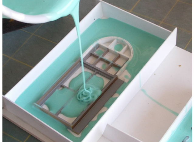
Pouring a window

and gives the “foot thick” wall with no problem saving many hours of construction time. Pressing too hard with a pencil will leave a mark, but that also means it can easily be carved with just a simple chisel or knife. Cutting or filing produces large amounts of fine dust that the manufacturer rates as non-toxic. A dust mask is a must, but with normal vacuuming it easily cleans up.