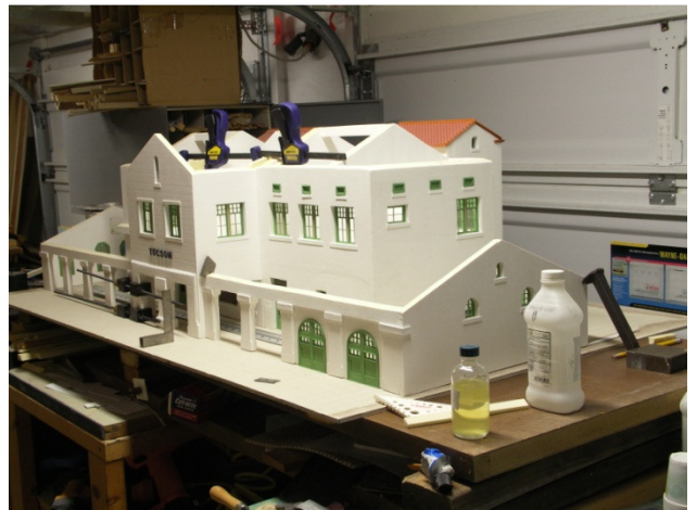
The Tucson Depot under construction

The body of the model is five box-like structures – the two towers, the center and two wings. Each was assembled separately and then glued together with Titebond III. Urethane glues like Gorilla Glue might be better but even a little oozing posed a real problem to clean up as the material was so soft and wears with even simple sanding. Precision Board comes in many higher densities, but that also makes them much harder to cut. Each section was painted inside and out with two coats of undiluted white elastomeric roof coating providing UV protection from Tucson’s harsh summer sun. Uncoated Precision Board will be attacked by the sun.