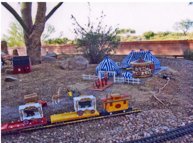
The Circus is coming to Cactus Corners RR