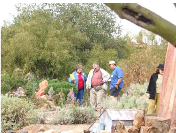
Guests admire the Eagle Mountain Railroad during the "Rails in the Garden" tour.