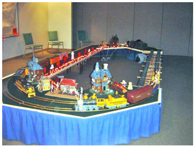
The new Children's Layout Photos courtesy of the Dorgans

On October 29th, we ran the childrens layout for their annual Halloween Party. We decorated with haunted houses, skeletons, black cats and cobwebs. Joe Stoesser came as the "largest goblin". Over 500 people attended, and it was very well received.