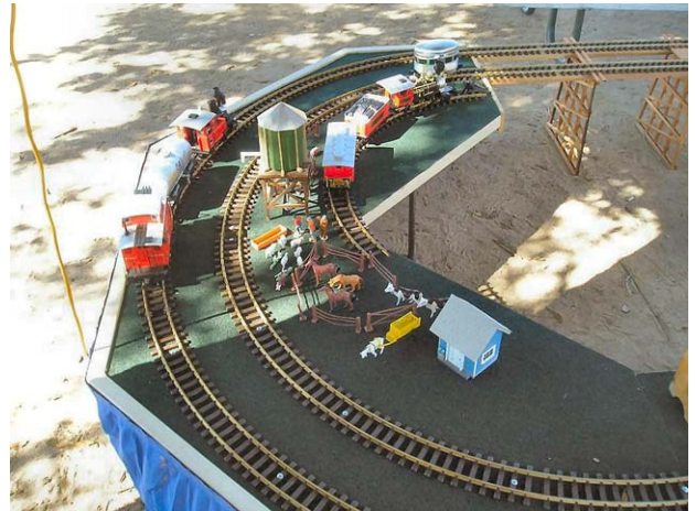
A close-up of the layout