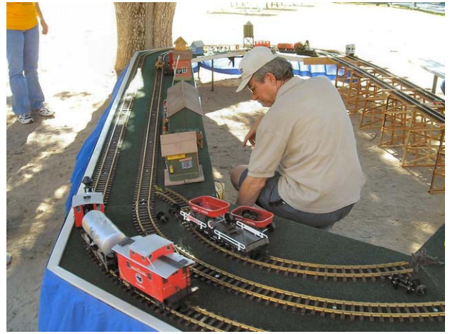
The new Children's Layout