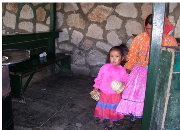
It is hard to resist a sales pitch from this basket vendor in Creel.