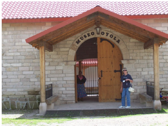
The not particularly impressive Museum entrance.

There was also a church which we visited before bussing back to Creel and boarding the train back to Divisadero and the Posada Barranca Mirador where we were treated to dances by Tarahumara natives who live on the canyon slopes. One man danced with rattles on his ankles made from butterfly cocoons while two other men provided the music with a guitar and locally made violin.