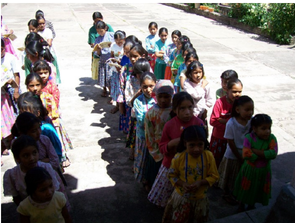
Tarahumara girls sing to us at the school.

We tried to avoid the rail congestion at Nogales by having the coach meet us at Magdalena. We did miss the slow moving rail yard but U. S. Customs decided to pull the bus over for passport scrutiny and examination of our hand luggage. To add insult to injury, ADOT decided to make us all get off a second time so that they could safety inspect the bus. After frustrating delays we returned to Tucson and home.