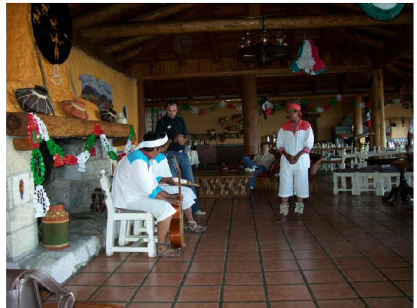
Tarahumara musicians and dancer preparing to perform.

Tuesday we rode the train from Divisadero to Bahuichivo where we took a bus to the Cerocahui. Once there we presented the toiletries and school supplies the TGRS members had donated and toured the school facilities.