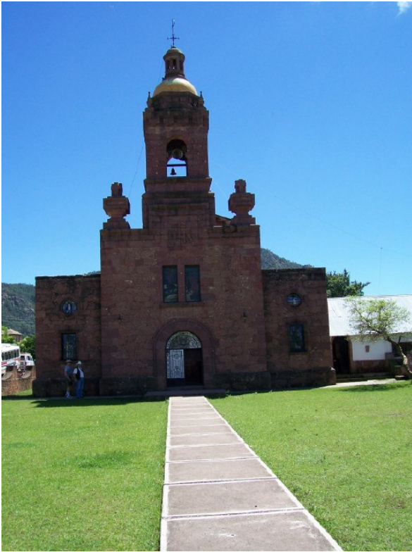
The Mission Church at Cerocahui.

Then the school children lined up and sang for us. Note the pleated skirts the girls make for themselves.