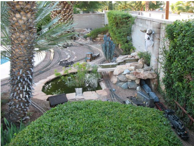
The T&T Railroad

We hope that club members will be able to come to the meeting and enjoy viewing the layout again. Please bring a chair and watch your step around the pool.