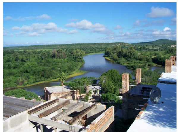
The El Fuerte River from on top of the fort/museum.