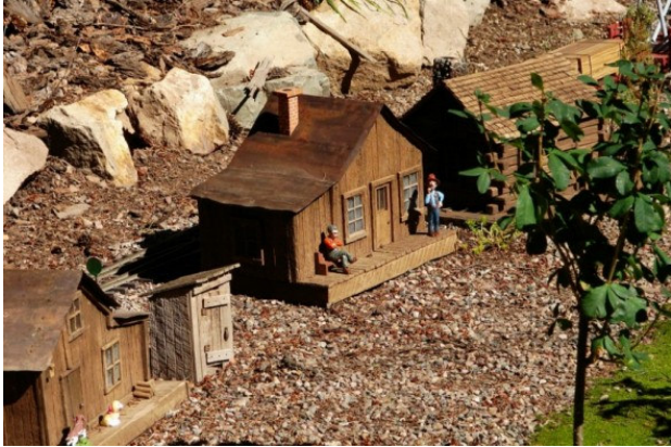
The White Water & Lemon Pass

The convention had many clinics and visits to the D&S shops. It seemed to be well run and well attended with numerous vendors showing their products.