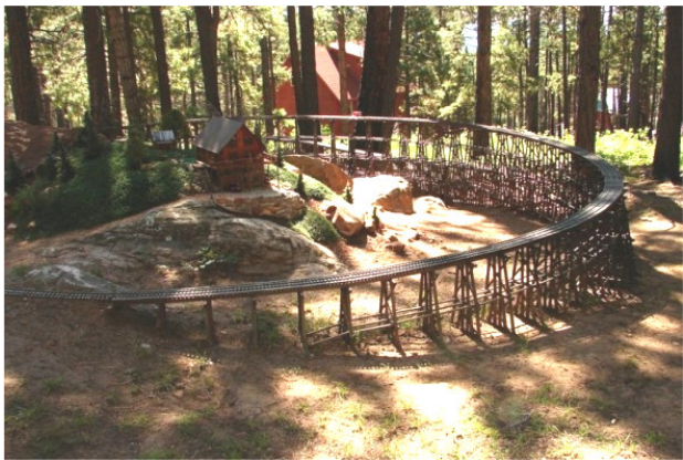
The Pine River, Tuckerville and Northerly RR