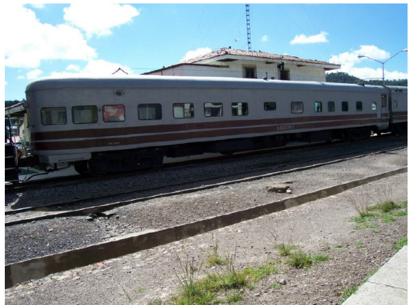
One of the four cars on our train, the round end observation Arizona.

The train consisted of four cars including Arizona, a beautiful round end observation car with five sleeping compartments, a bar, and a large lounge complete with a DVD player which came in handy as Gary had brought DVDs of the Santa Clara convention.