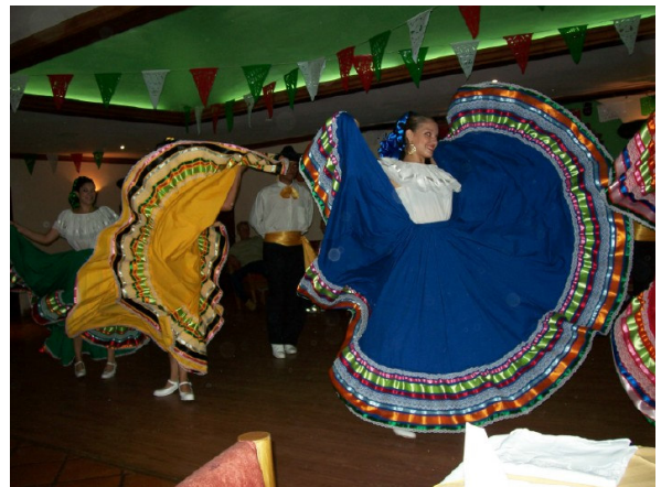
Dancers at El Fuerte.

At El Fuerte we stayed at the luxurious hotel Posada Del Hidalgo which had been created from several mansions. Before dinner we were treated to a spectacular performance by Mexican dancers.