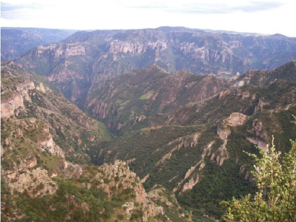
Copper Canyon as seen from our room's balcony.