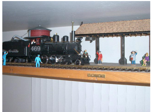
A train stops at the passenger platform

on coal and water. We also have a vast collection of Mickey Mouse memorabilia for your viewing.