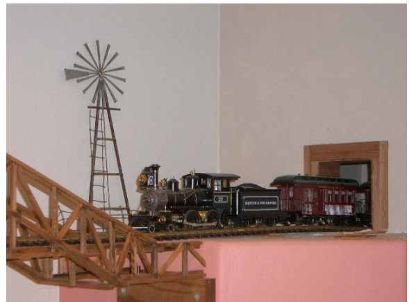
A train approaches the bridge