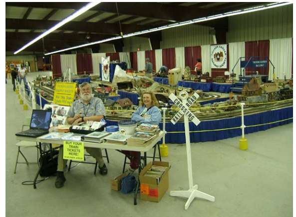
A very impressive layout at the fair