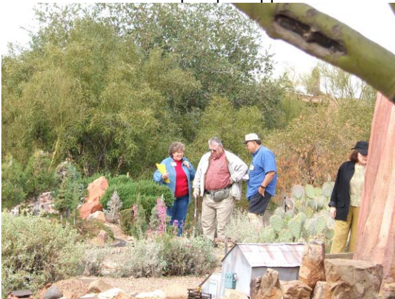
Guests admire the Eagle Mountain Railroad during the "Rails in the Garden" tour.