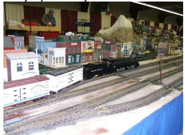
A train passes in front of the town