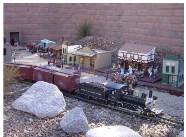
A train passes through a town on the Red Rock Railroad