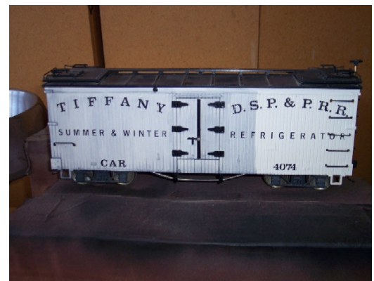
White car about 2/3 coated with dilute Ink and Alcohol solution.

The problem I encountered was how to weather the light bright colored cars. I have a white Tiffany Refer and two yellow (a Colorado and Southern and a Pacific Fruit Express) wood refrigerator cars. I was afraid that even a light dusting of the light gray primer would change the color and hide the base coat.