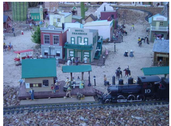
A train is approaching the passenger platform on the Red Rock Railroad

The layout covers the front, back, and side yards.