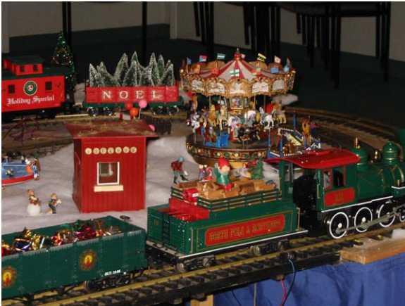
The children's layout at Casa de los Niños, photo by Phyllis Dirksen

The first day of the children's layout went over very well. The layout was decorated and looked splendid. Several children came and watched the trains and some of them would have liked to stay longer.