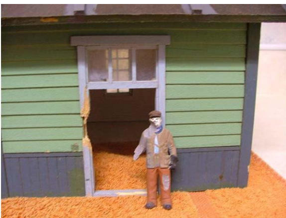
Damage caused to the building and figure

Last spring Dave removed his Mule Ear Station from our layout for renovation. He stored it temporarily outside on decorative rock near our garage door and covered it with a large plastic container topped with a heavy rock to prevent pests. Several months later he was ready to begin work and removed the plastic container. As he pushed the building across the stones, a furry creature shot out the back door and fled into the bushes.