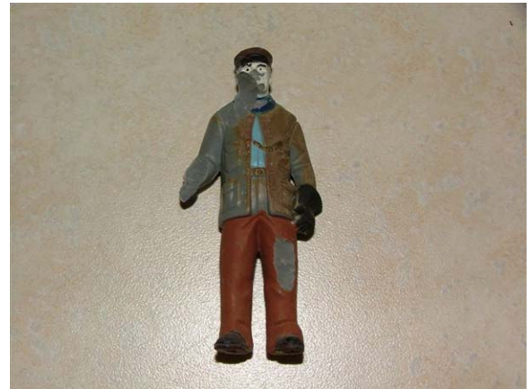
Close up of damage caused to the figure

packrat nest, complete with people which had been glued to the outside platform. The enterprising packrat had taken up residence in the safe, warm station and begun accumulating little figures to live with him. Several of the people had their hands gnawed off or heads chewed. Two doorways were gnawed to gain access, and interior electrical wires and lights were also destroyed.