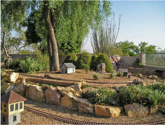
Tracks run through a well landscaped backyard