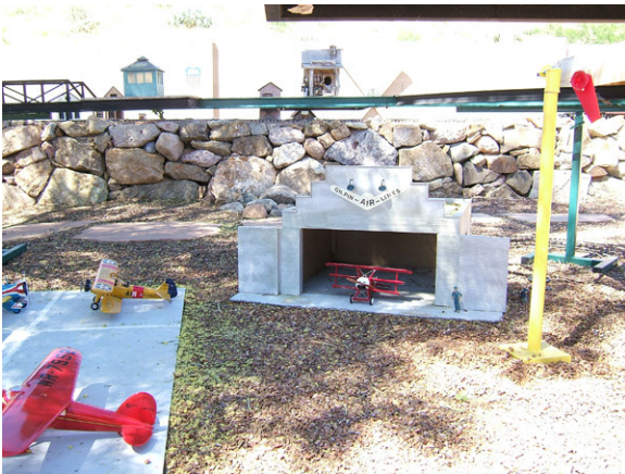
The Gilpin Air Lines hanger at the airstrip that is under the Egg Liner elevated loop.