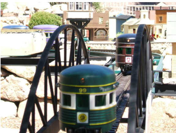
Egg Liners on the elevated loop.