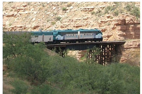
The locomotives crossing a trestle