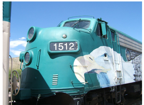
Locomotive 1512 with it's Eagle paint scheme

http://www.verdecanyonrr.com/index2.html